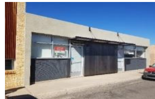
Some of Consuelo's Recent Transactions