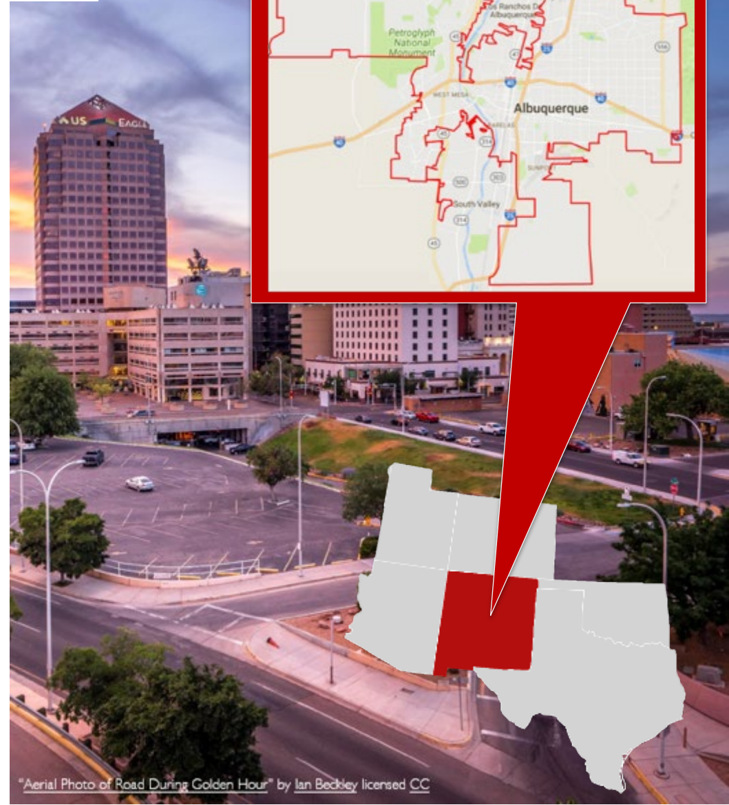
"Aerial Photo of Road During Golden Hour"