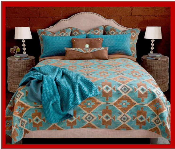
Striking Home Décor